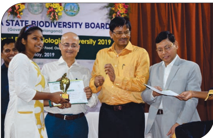
Painting Competition winner (Sr. Category)