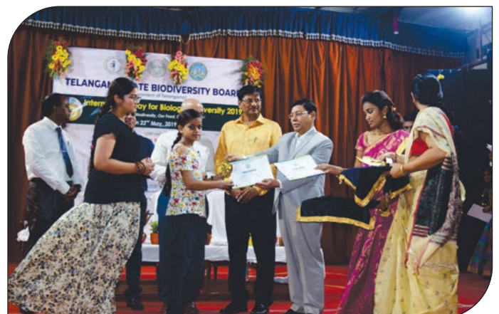
Painting Competition winner (Jr. Category)