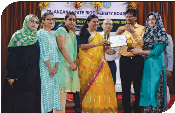
1st Prize winner for Quiz Competition