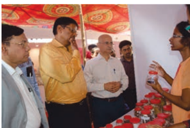
Inaugural of Exhibition Stalls on Organic & Health Food & Medicinal Plants

As part of the celebrations, the exhibition stalls were setup on Medicinal plants, organic & Health food items, Agri biodiversity of Telangana State, wild flora, poster presentations on biodiversity of Telangana state by various institutions viz; Pro. Jaya Shankar Telangana Agriculture University, World Wildlife Fund for Nature (WWF), BMC of Jheri, Seed NGO, Butterfly Conservation Society, Botanical Survey of India, Zoological Survey of India, Telangana State Biodiversity board, Inner Being, Organic farming and others. These stalls attracted the attention of the participants and dignitaries.