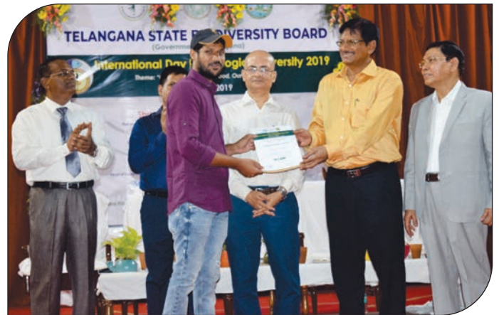
Winner for Nature Photography Competition