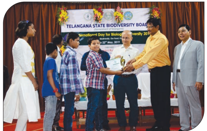
1st Prize winner for Painting Competition