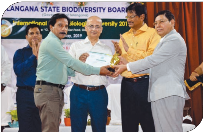
1st Prize winner for Nature Competition